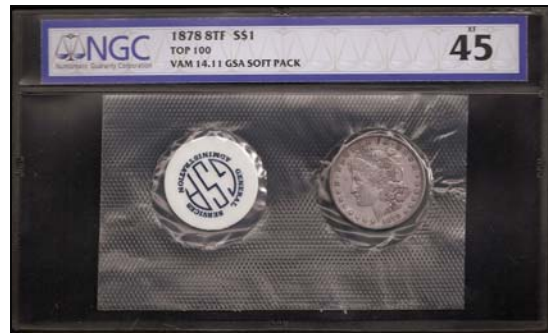
GSA 1878 8TF VAM 14.11 NGC 45