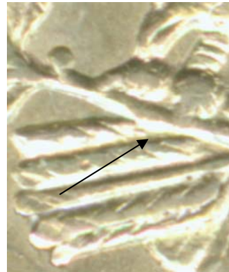
Rare 1921 VAM 44 Wide Reeding